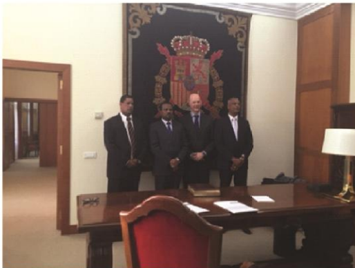
በባርሲሎና ከተማ የመግባቢያ ሰነድ ሲፈረም

‘የአዲስ አበባን ኤግዚቢሽን እና ኮንቬንሽን ማዕከል’ በዘመናዊ መልክ መገንባት ለአገራችን ቁልፍ የልማት ስኬት ነው !