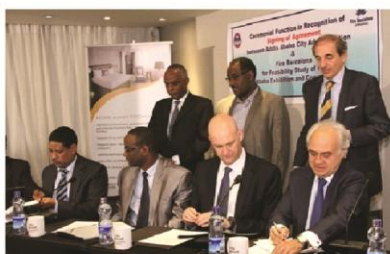
Ceremonial functions in Barcelona and Addis Ababa

During the visiting programme it was disclosed that the major precondition was set when a higher level delegation of Spain led by H.E. Miguel Angel MORATINOS, former Spanish Minister of Foreign Affairs and Cooperation, came to Addis Ababa on the 4 th and 5 th of February 2015 and discuss the project idea with top officials of the Ethiopian government including the Mayor of Addis Ababa taking into consideration the strategic potentials of Addis Ababa as the hub of the African Union Head Quarter, the seat of over 100 embassies and its sustainable economic growth.