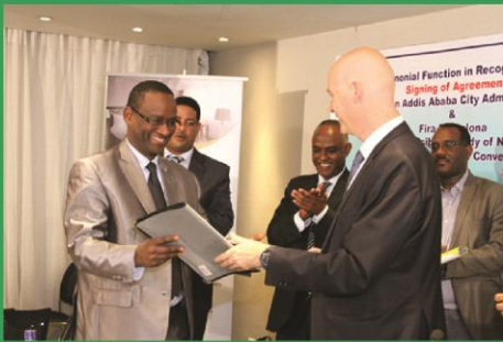
During the signing of agreement for the feasibility study

Agreement for the Feasibility Study of 'Addis Ababa Exhibition and Convention Center' was signed between the Addis Ababa City Administration and Fira Barcelona of Spain on 20 June 2016 at Marriott Hotel.