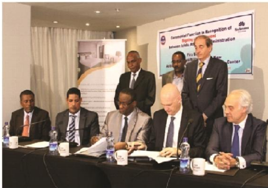
በአዲስ አበባ የአዋጭነት ጥናት ውሳኔ ሲፈረም

በመሥራት ላይ የሚገኘውን የአዲስ አበባ ኤግዚቢሽን ማዕከል እና የገበያ ልማት ድርጅትን በዘመናዊ "የኤግዚቢሽን እና ኮንቬንሽን ማዕከል" ለመተካት ሲካሄድ የነበረው ቅድመ ዝግጅት ተጠናቆ እ.ኤ.አ. በ 08/03/2016 በባርሲሎና ከተማ ከቡር አቶ ድሪባ ኩማ የአዲስ አበባ ከተማ አስተዳደር ከንቲባ በተገኙበት የመግባቢያ ሰነድ ከተፈረመ በኋላ የአዋጭነት ጥናቱ በይፋ የተጀመረበት የውሳኔ ስምምነት በአዲስ አበባ ከተማ አስተዳደር እና በፌዴራል ባርሲሎና መካከል ሰኔ 13 ቀን 2008 ዓ/ም በማርዮት ሆቴል (አዲስ አበባ) ተፈርሟል፡፡