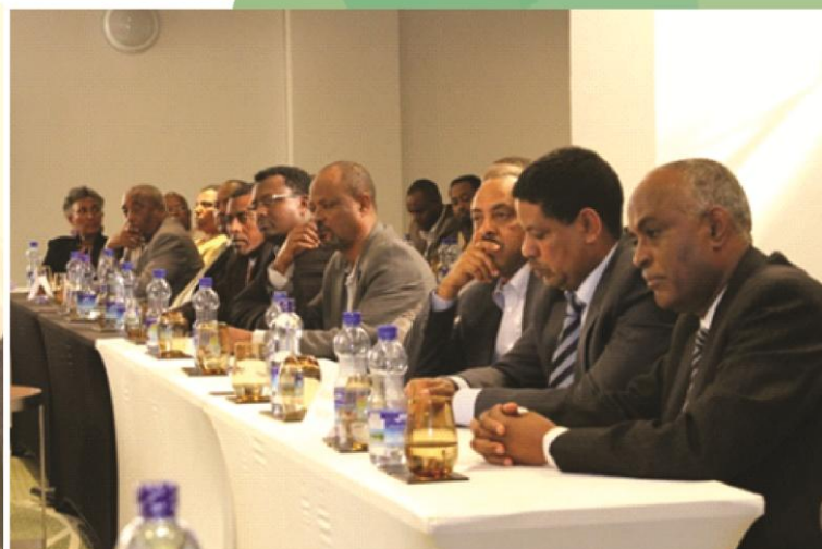
አምባሳደር ቦርጅ ሞንቶሲኖ መልዕክት ሲያስተላልፉ